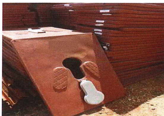
Plastic slab image 2